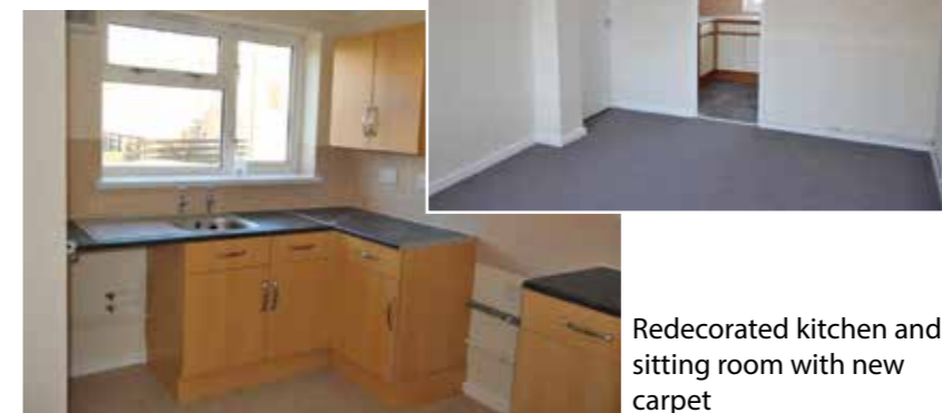
Redecorated kitchen and sitting room with new carpet

As a result we reduced our empty properties from 290 in April 2017 to 157 in April 2018. The number of long term empty flats (six months plus) also fell from 69 to 36 - and this figure has fallen further since April. As the number of long term empty properties falls, our void property turnaround time will improve from the 70.6 days on average it takes at present.