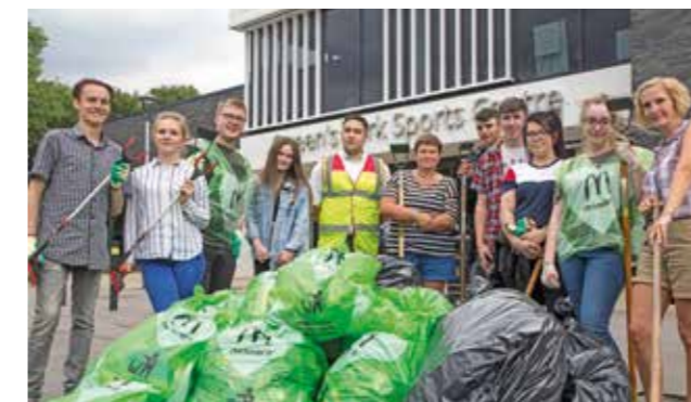
Statistics for the period from April 2017 to March 2018

We're also keen to help community groups wanting to improve their local area.