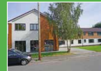
Improving the quality of the schemes will increase housing options for older people across the borough.

Following the successful refurbishment of Brocklehurst Court last year we will begin works to refurbish two further older persons schemes - Catherine Court and Glebe Court.