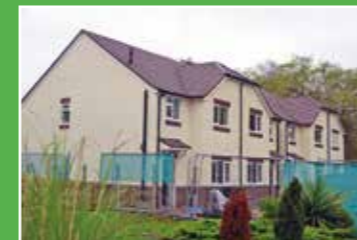
Brampton and former Brockwell Court at Loundsley Green.

After building new properties at Rufford Close we will build 46 new homes on three sites across the borough in 2018/19 - Manor Drive at Brimington, former Heaton Court at