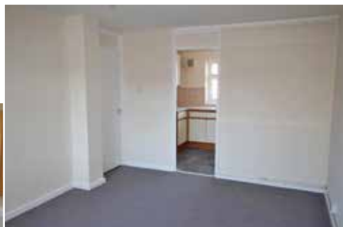
Redecorated kitchen and sitting room with new carpet

91,537 calls to our Careline service. 95% were answered in 60 seconds