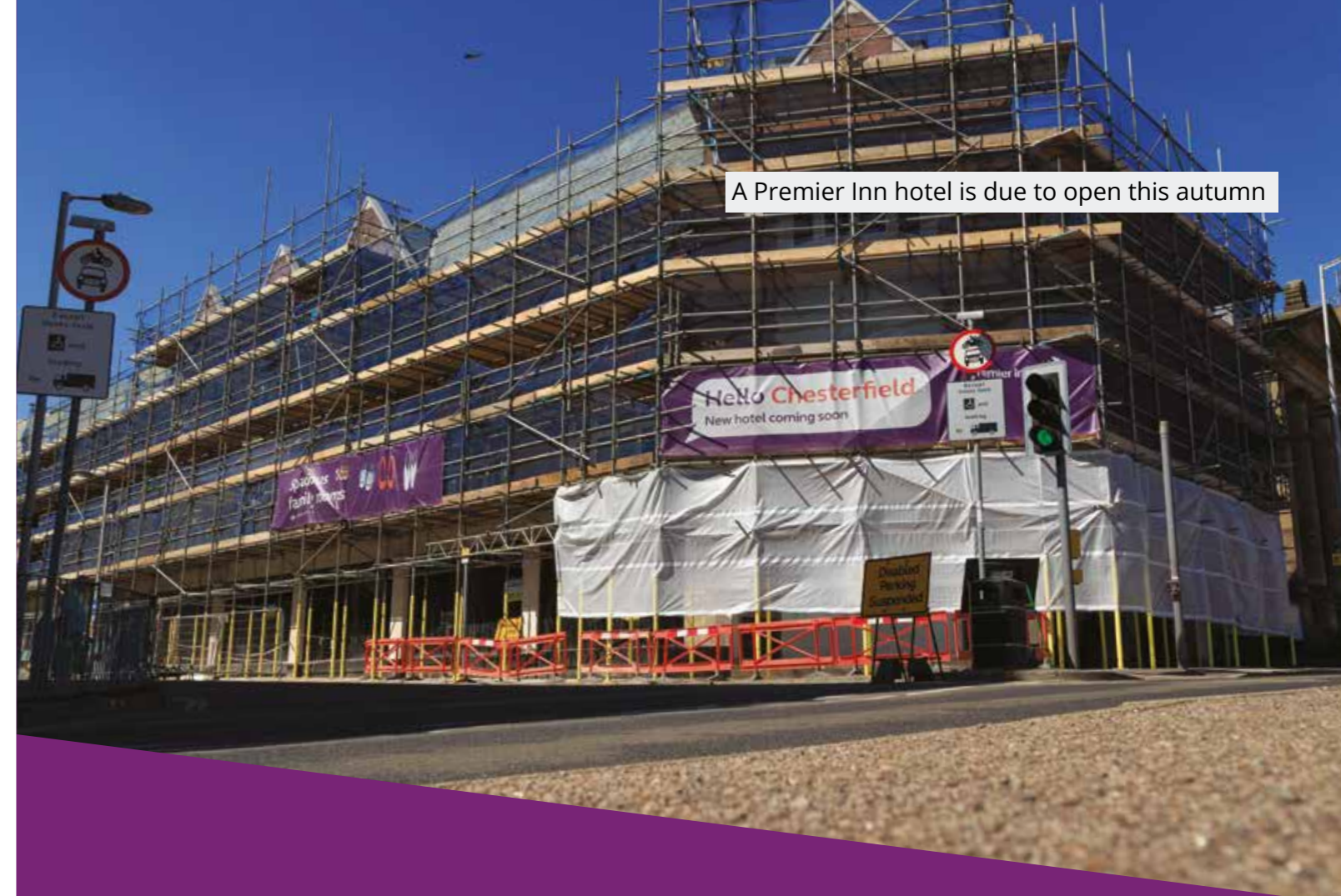
A Premier Inn hotel is due to open this autumn

Work is set to be finished this autumn on transforming the former Co-op department store on Elder Way.