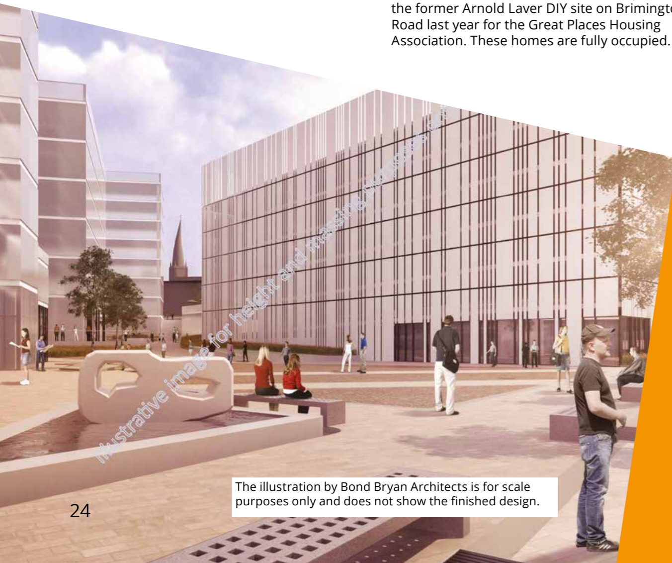
The illustration by Bond Bryan Architects is for scale purposes only and does not show the finished design.

The first phase of the Waterside development saw 19 new affordable homes built on part of the former Arnold Laver DIY site on Brimington Road last year for the Great Places Housing Association. These homes are fully occupied.