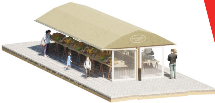
Please note this is not the final colour scheme or branding.

The £10.28 million Revitalising the Heart of Chesterfield scheme will improve the look, feel and flow of key areas, to create a more contemporary market town built on our proud history and heritage – helping it thrive for generations to come.