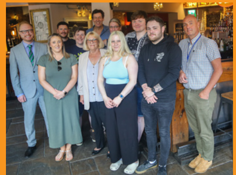
Representatives from across the town centre who have signed to the Best Bar None scheme.

The new digital radio network is just one initiative which is benefiting from funding through the UKSPF, after the council was successful in securing £2.6m from the Government fund.