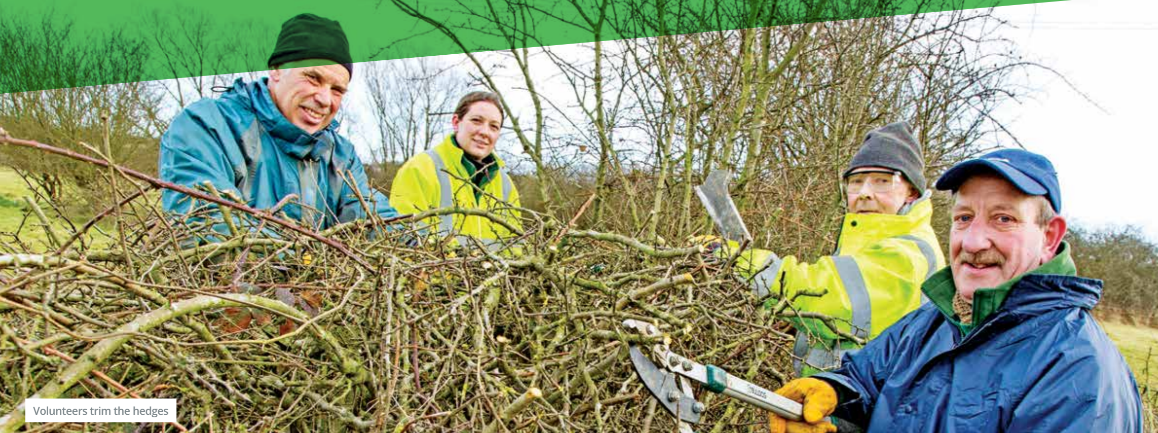
Volunteers trim the hedges